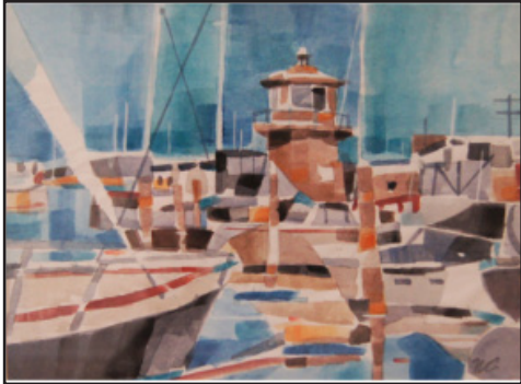
Essex Impression, watercolor, Bill Colrus

Work from reference photos and demos to learn composition, color mixing, starting a painting and developing it to a finished stage. Explore light watercolor washes and thick impasto painting. All levels welcome. Material list available.