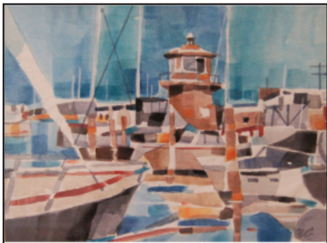
Essex Impression, watercolor, Bill Colrus

Work from reference photos and demos to learn composition, color mixing, starting a painting and developing it to a finished stage. Explore light watercolor washes and thick impasto painting. All levels welcome. Material list available.