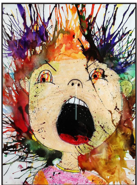
Self Portrait blow painting

Ages 6-8 (9-10:30am) $110 Members save $11